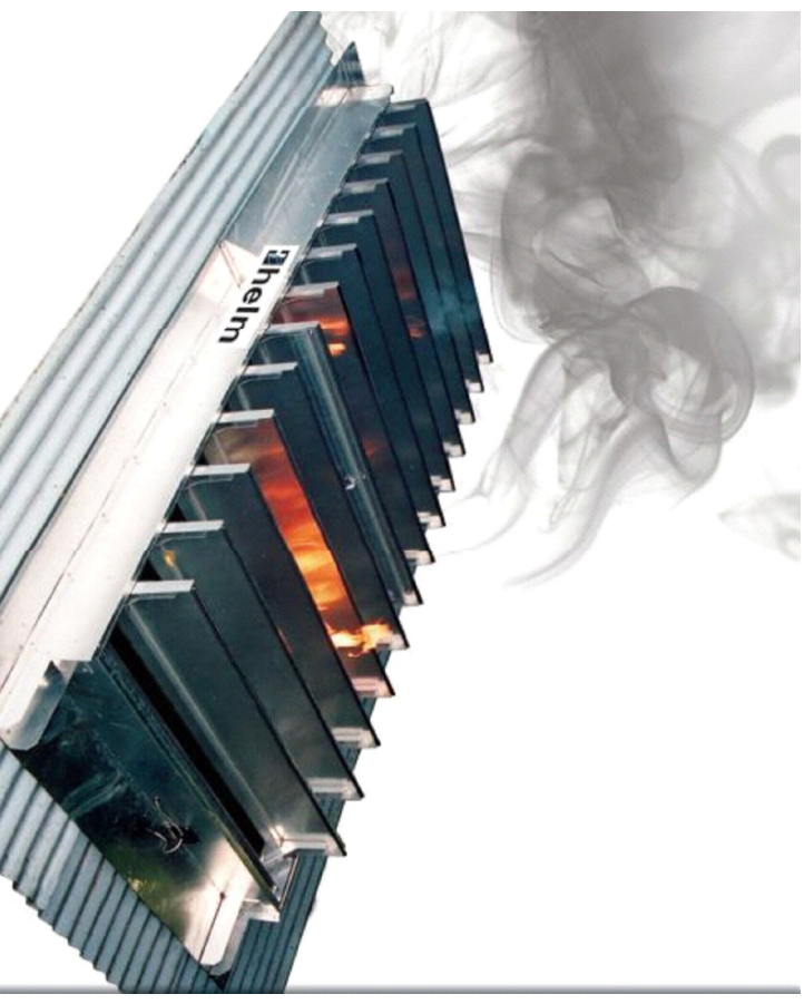
H-ARV (HELM AUTOMATIC RELEASE VENTILATOR) IN OPEN POSITION