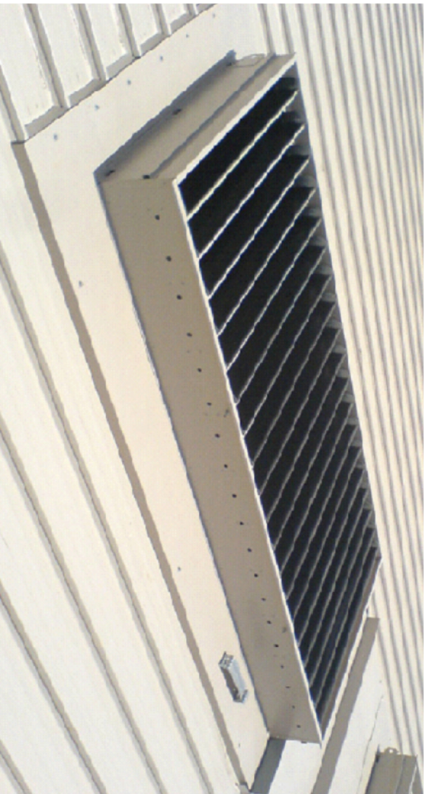
TYPICAL INSTALLATION OF A HELM-RLV VENTILATOR